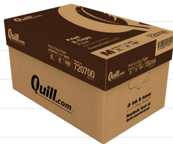
Quill Brand® Multipurpose Copy Paper 20 lb. | 94 Bright