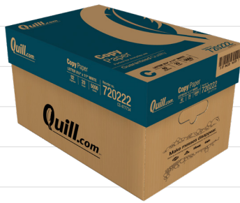
Quill Brand® Copy Paper 20 lb. | 92 Bright

Great values for smaller order quantities