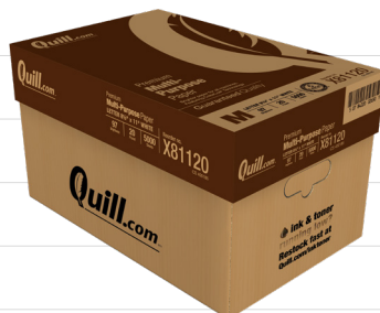
Quill Brand® Premium Multipurpose Paper 20 lb. | 97 Bright